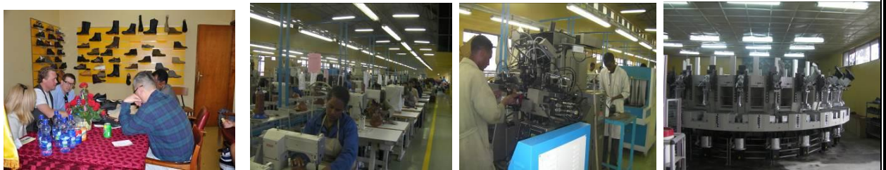
Peacock – Mens Footwear (Leather)