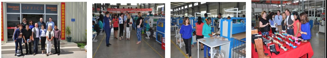
Tikkur Abbey – Mens Footwear (Injection Shoes)